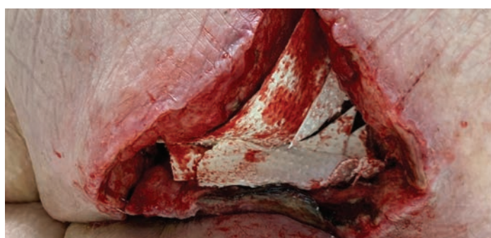
Abdominal - Initial Defect

54-Year-old female with hypertension, hyperlipidemia and morbid obesity (BMI 45). Patient developed a perirectal abscess that progressed to an NSTI of the right gluteus. The infection tracked to the retroperitoneum requiring intraabdominal debridements. The resultant gluteal and abdominal wounds both required reconstruction. The approximate gluteal and abdominal wound sizes were 20 x 15 x 10 cm and 25 x 5 x 4 cm, respectively. Myriad Matrix 10 x 20 cm, 3-layer was placed dry and hydrated in situ. By 5 weeks, the periwound inflammation and depth of the cavity had significantly reduced with minimal drainage. By 9 weeks, the gluteal wound was 100% healed and the resulting tissue was soft and pliable. The abdominal wound was 95% healed with the inferior portion significantly improved. By 12 weeks, the abdominal wound was fully healed.