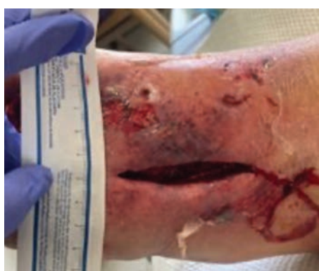
1 st Procedure