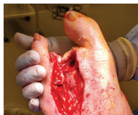
2 nd Procedure